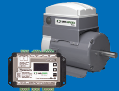
Vari-Green® Motors and Controls

• Greenheck Vari-Green® motor available for motor sizes through 10 hp