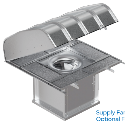
Supply Fan with Optional Filters