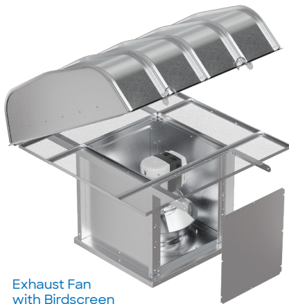
Exhaust Fan with Birdscreen