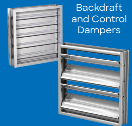
Backdraft and Control Dampers