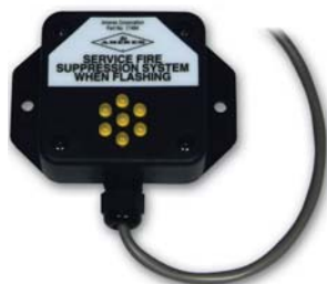
Part No. 17484