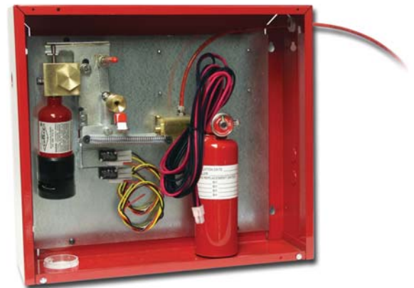
(TUBING AND NITROGEN CARTRIDGE SOLD SEPARATELY)