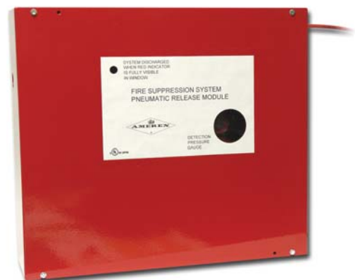
(SHOWN WITH COVER)