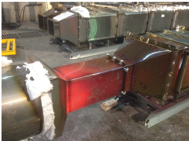
Abnormal Temperature Test PCU must completely contain all smoke and flame to pass UL 1978 test standard. Greenheck unit passed all UL 1978 est criteria.

ETL determined that evaluating PCUs to the heat related tests from UL 710 - Standard for Exhaust Hoods for Commercial Cooking Equipment, listed of page 3, were adequate to obtain an ETL Listing for PCUs.