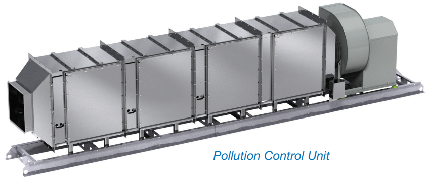
Pollution Control Unit

A PCU serves three main purposes. Its first purpose is to exhaust grease laden air from the commercial kitchen space through a Type I kitchen hood. Initial filtration of the grease laden air ideally occurs at the