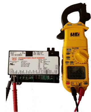
Fig. 3 BASO Ignition Control